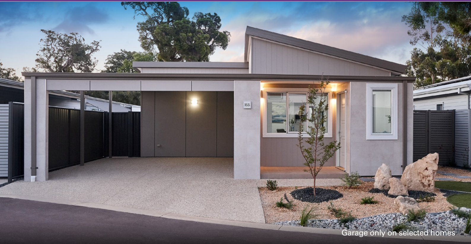
Garage only on selected homes