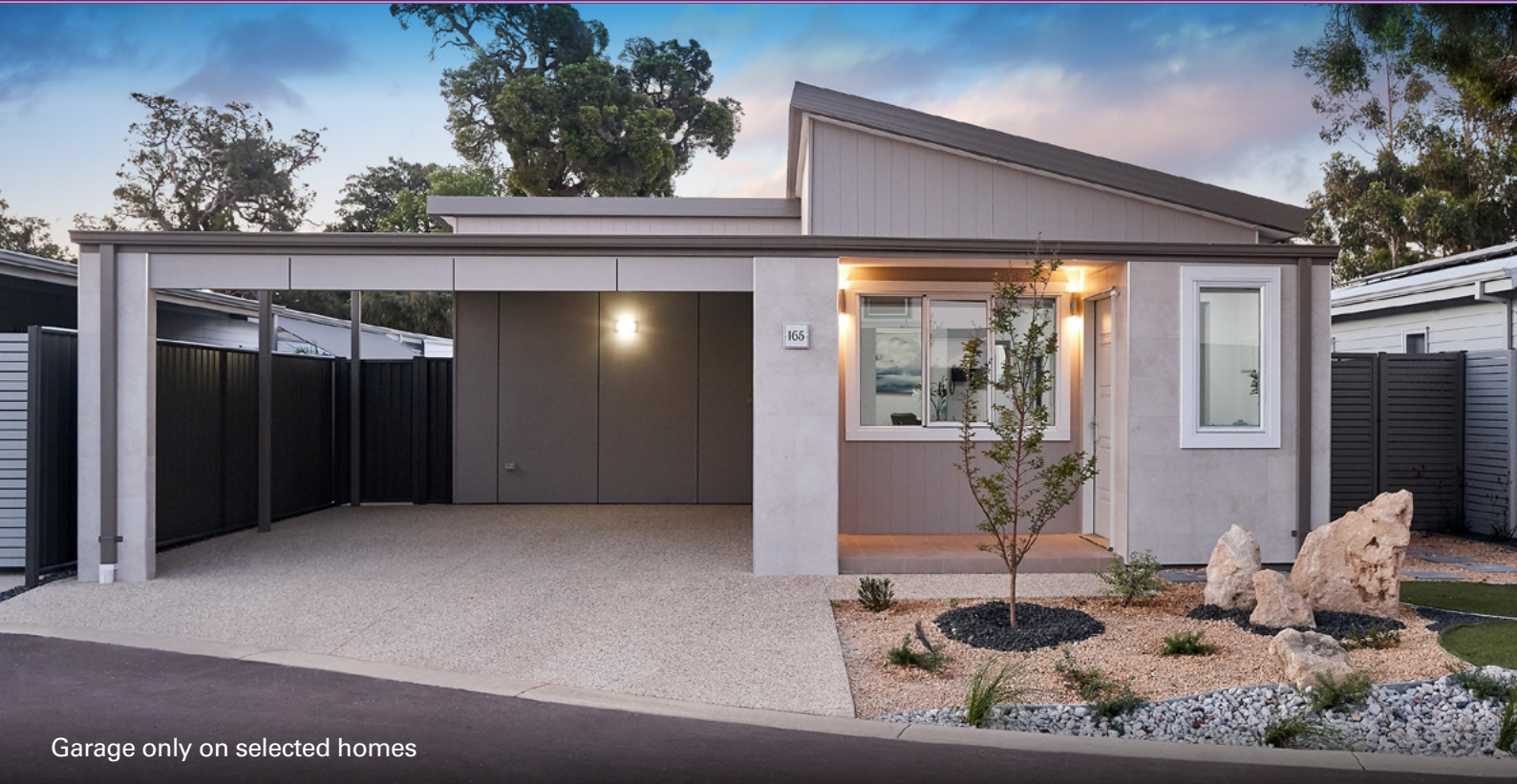
Garage only on selected homes

Providence Lifestyle Piara Waters Resort