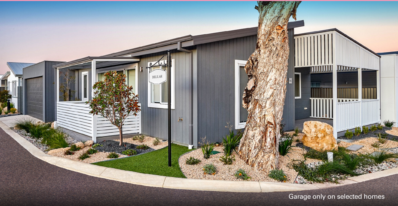
Garage only on selected homes