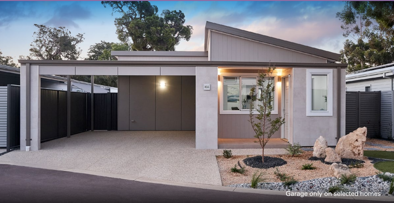
Garage only on selected homes