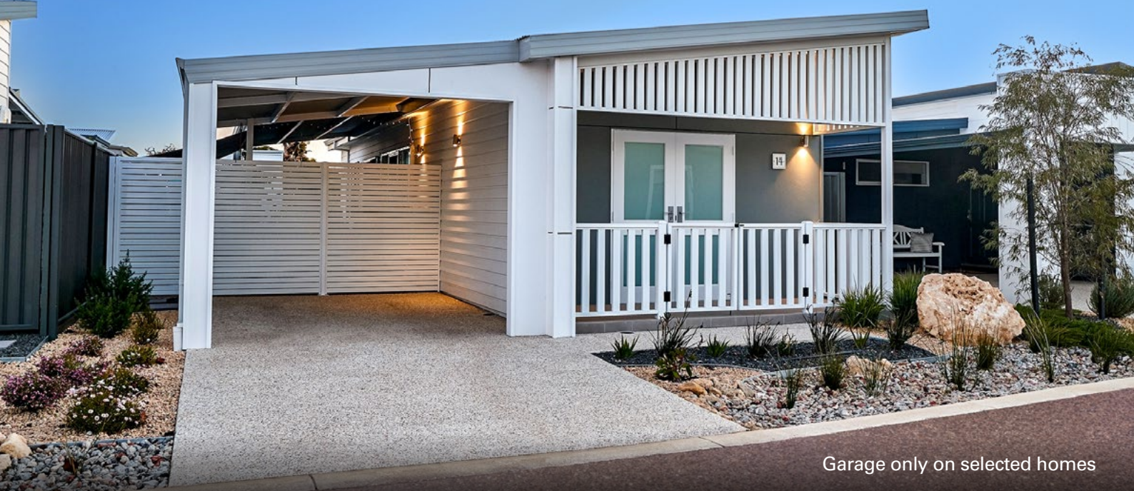
Garage only on selected homes