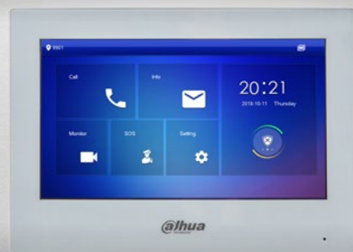
Audio and visual intercom to the Resort's entrance gates