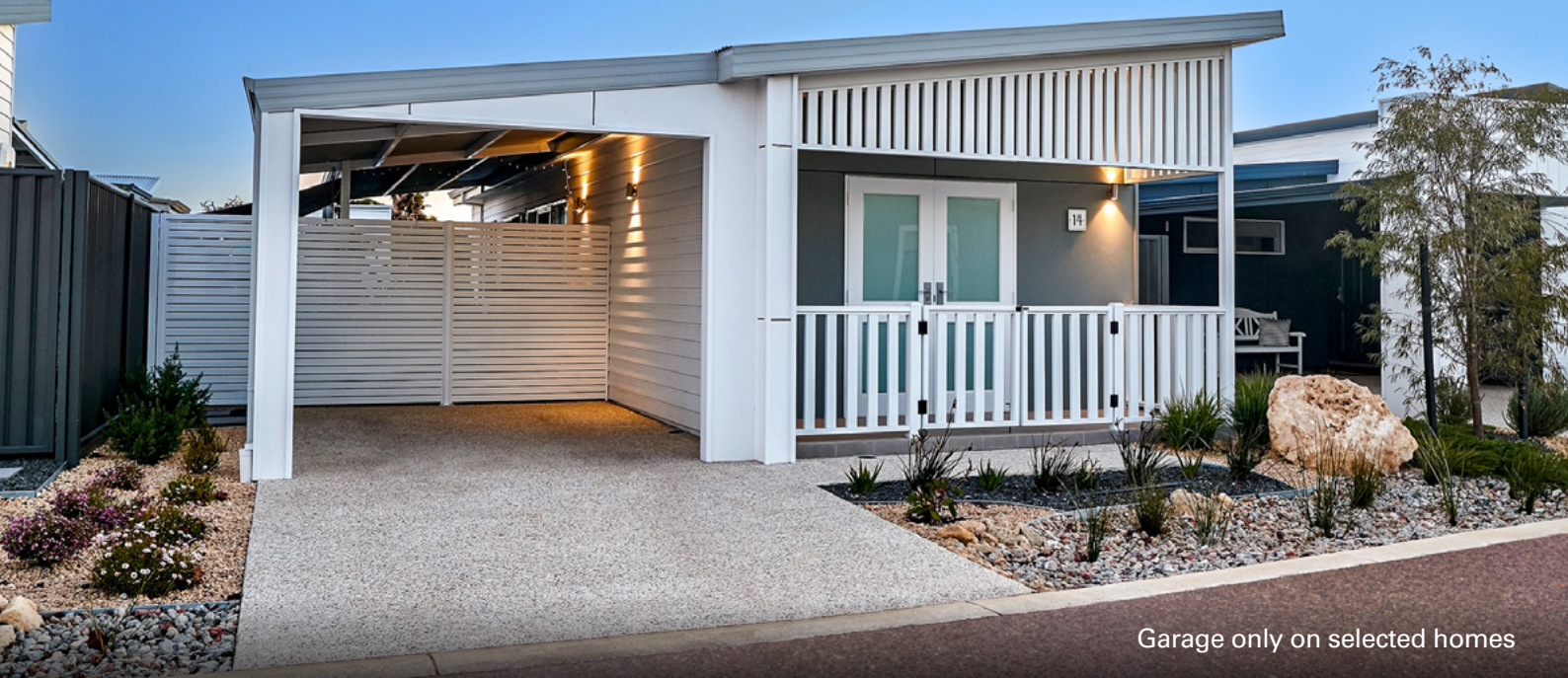
Garage only on selected homes