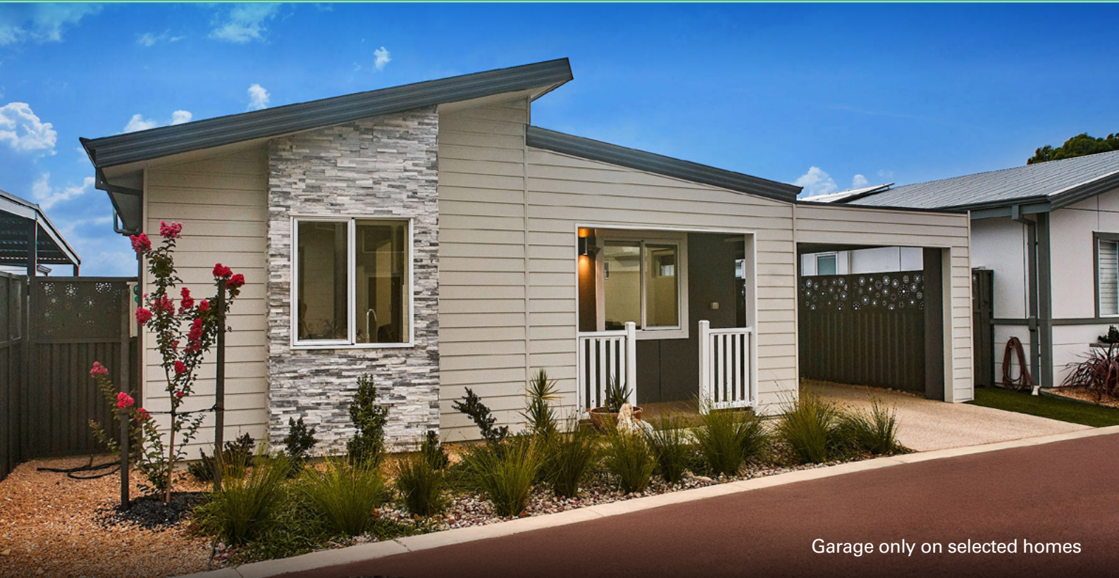
Garage only on selected homes